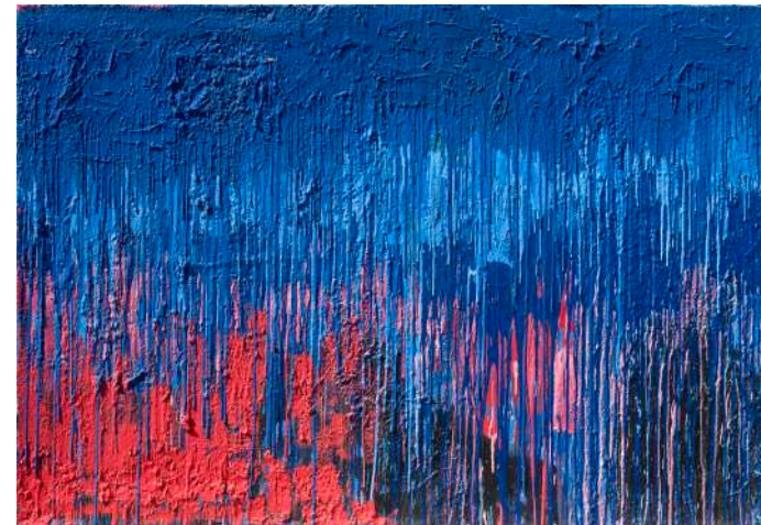
Miro Vuco, Residuum , 1979 – 1995, oil, mixed media, canvas, 1324 × 2001 mm

viennacontemporary 2025 11 – 14 September 2025