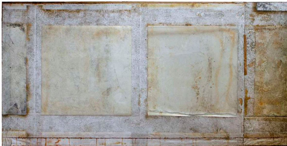
Baldo Diodato, JFK Plaza Frottage, Philadelphia, 1974 , frottage, mixed media, canvas, 1369× 2748 mm

Diodato's practice aligns with the framework of analytical art, in which execution itself is an act of inquiry rather than a completed representation.